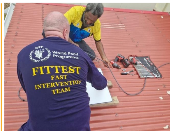
A FITTEST Senior Telecommunications Specialist installs a high performance satellite-based internet connectivity terminal at the Shefa Provincial Health Office to assist in the coordination of medical activities for the province, which was heavily impacted by the earthquake.