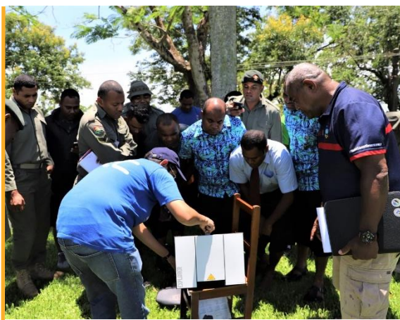
The ETC trains responders in Fiji on the use of satellite connectivity equipment.

Deploying a teleconferencing solution to Vanuatu's Ministry of Health Emergency Operations Centre (EOC), in support of the Office of the Government Chief Information Officer (OGCIO);