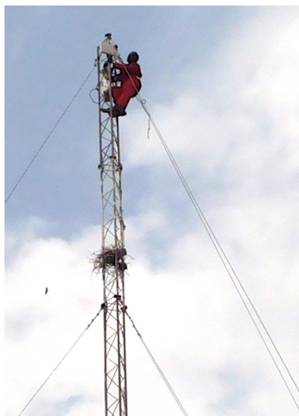
Installing HISP services at the PAH Compound in Bor (Jonglei State)